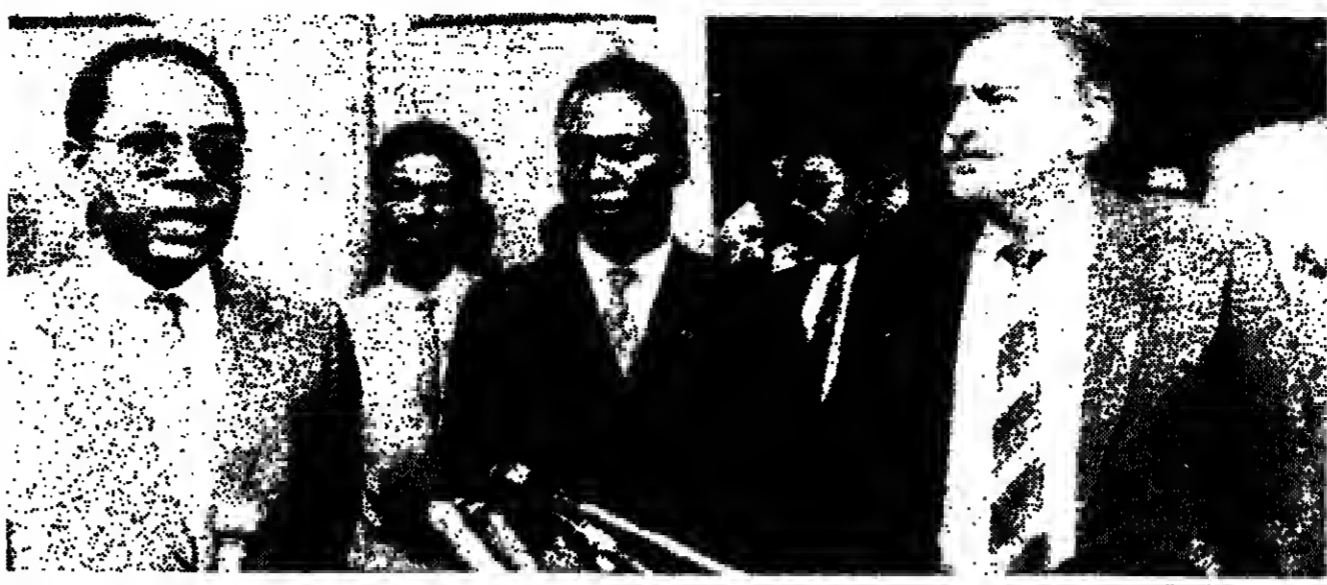
Justice Minister Fernando Van Dunem of Angola, left, and Foreign Minister R.F. Botha of South Africa after meeting Friday in Congo.